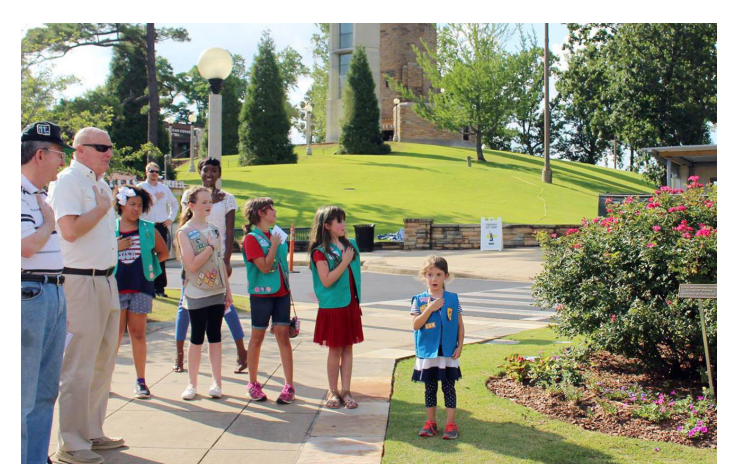
Local girl scouts help lead 2016 Flag Day ceremony at Vulcan Park and Museum.

This listing reflect gifts received between July 1, 2015 and June 30, 2016. We regret any error or omission that may have occurred.